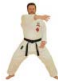
#9 Circle the hand twice clockwise.