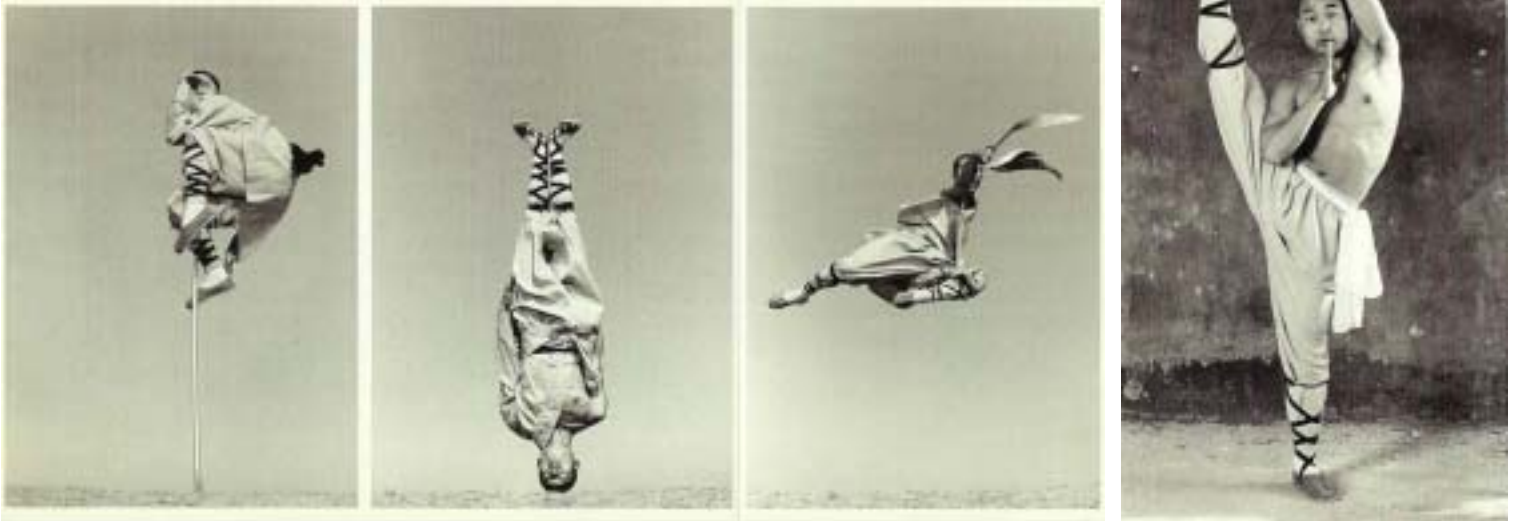
Here are some cool shots I found the other day while going through some old China stuff from the 2004 trip.