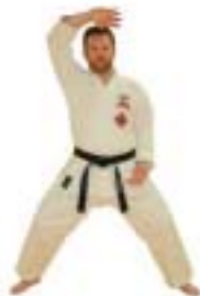
#7 Circle the right hand over head.