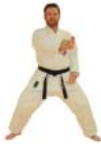
#3 Push to the left shoulder.