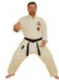
#4 Hit to the right shoulder Kakuto.