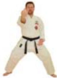
#2 Hit with the right wrist Kakuto.