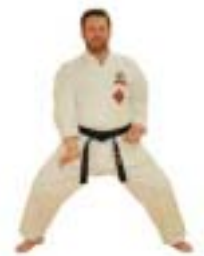
#10 Drive the hand down Teisho.