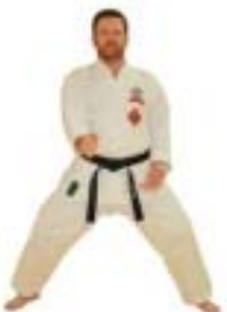
#6 Drop the right hand down Shuto.