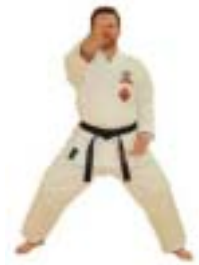
#5 Raise the right hand in a Haito position.