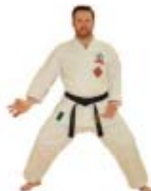
#8 Keep circling the hand clockwise.