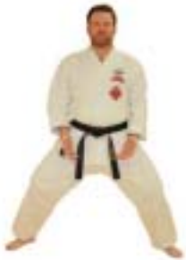
#1 Starting position.