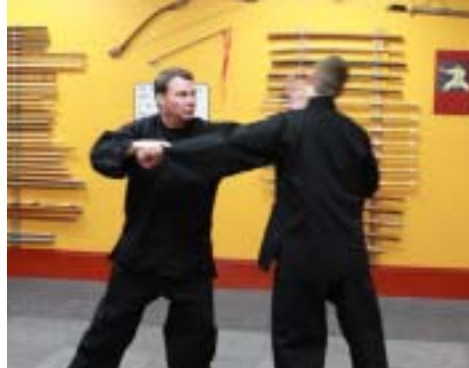
Pull with the right and chop the neck.