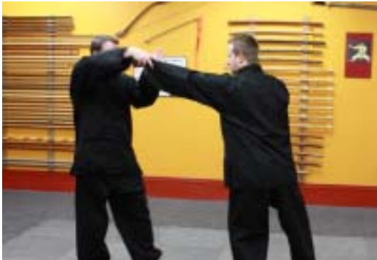
Block and grab the jab.