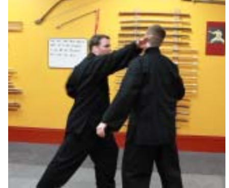
Heito the temple with the right.

The single whip is a classic Tai Chi move, although different styles will perform it slightly differently, the outcome is basically the same, block and counter, breathe in and breathe out. Now the question is - which is the right way? They all are, as long as you understand the principle and the application.